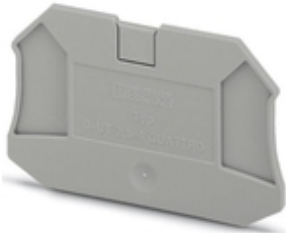
End cover, length: 64.4 mm, width: 2.2 mm, height: 39.8 mm, color: gray

Please be informed that the data shown in this PDF Document is generated from our Online Catalog. Please find the complete data in the user's documentation. Our General Terms of Use for Downloads are valid ( http://phoenixcontact.com/download )